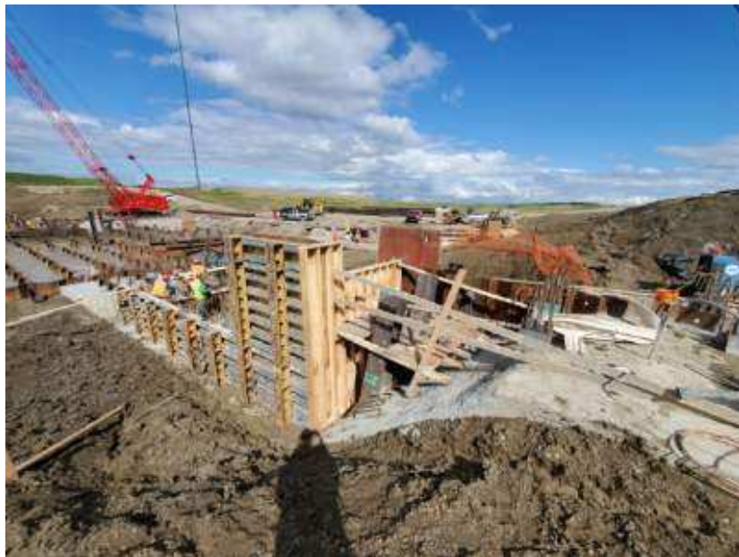
Diversion Inlet Structure - preparing for first concrete pour